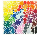
Polly Apfelbaum (American (b. 1955)) Potpourri - Love, edition 21/25 , 2012 woodblock 32 x 32 1/2 in. 2019.120b