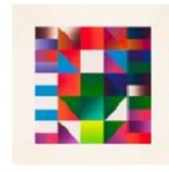
Polly Apfelbaum (American (b. 1955)) Atomic Mystic Particle 6 , 2016 woodblock monoprint 13 5/8 x 13 5/8 in. 2019.132