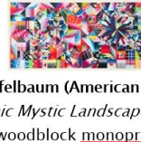
Polly Apfelbaum (American (b. 1955)) Atomic Mystic Landscape , 2017 woodblock monoprint 35 3/8 x 68 in. 2017.614