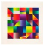
Polly Apfelbaum (American (b. 1955)) Atomic Mystic Particle 8 , 2016 woodblock monoprint 13 5/8 x 13 5/8 in. 2019.134