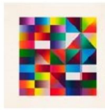
Polly Apfelbaum (American (b. 1955)) Atomic Mystic Particle 3 , 2016 woodblock monoprint 13 5/8 x 13 5/8 in. 2019.131