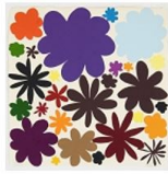
Polly Apfelbaum (American (b. 1955)) Little Love 50 , 2008 woodblock monoprint 20 x 20 in. 2019.121