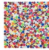
Polly Apfelbaum (American (b. 1955)) Dogwood Leap 2 , 2009 woodblock monoprint 47 x 47 in. 2019.123