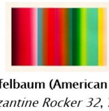
Polly Apfelbaum (American (b. 1955)) Byzantine Rocker 32 , 2016 woodblock monoprint 24 1/8 x 37 in. 2019.128