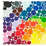
Polly Apfelbaum (American (b. 1955)) Potpourri - Dogwood, edition 21/25 , 2012 woodblock 32 x 32 1/2 in. 2019.120c