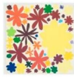
Polly Apfelbaum (American (b. 1955)) Little Love 52 , 2008 woodblock monoprint 20 x 20 in. 2019.122